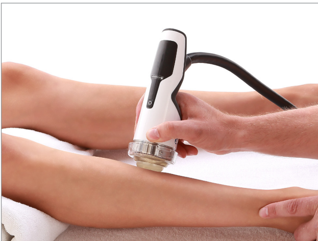
Tibial stress syndrome