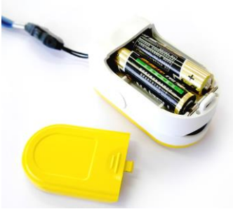
Figure 3. Batteries Installation

⚠Please take care when you insert the batteries for the improper insertion may damage the device.