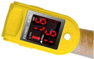
Figure 5. Put finger in position