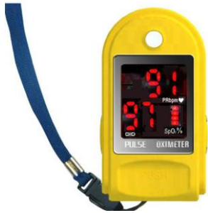
Figure 4. Mounting the hanging rope

Step 1. Put the end of the rope through the hole. Step 2. Put another end of the rope through the first one and then tighten it.